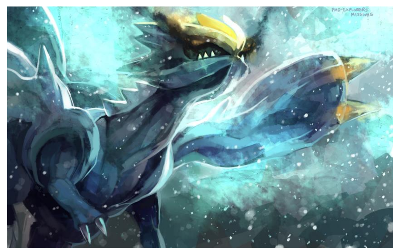
Domains: Fate, Peace, Solitude

Few scholars do know that, in reality, when the twin dragons were born, a third was left remains as a husk of their former whole; this being is known as Kyurem. This deity wishes for nothing more than to unify once again with its severed halves and cease their endless conflict. The practicality of this is questionable, as even to this day Kyurem has yet to find a means to draw these two together, or an individual of the mortal world with the means to do so. In the recent era, Kyruem has grown tired of this war it cannot quell, and has become a hermit of sorts. It hides away in the coldest parts of the world, watching and mulling over its past failures, but hopes that one day a hero will call upon it has long passed.