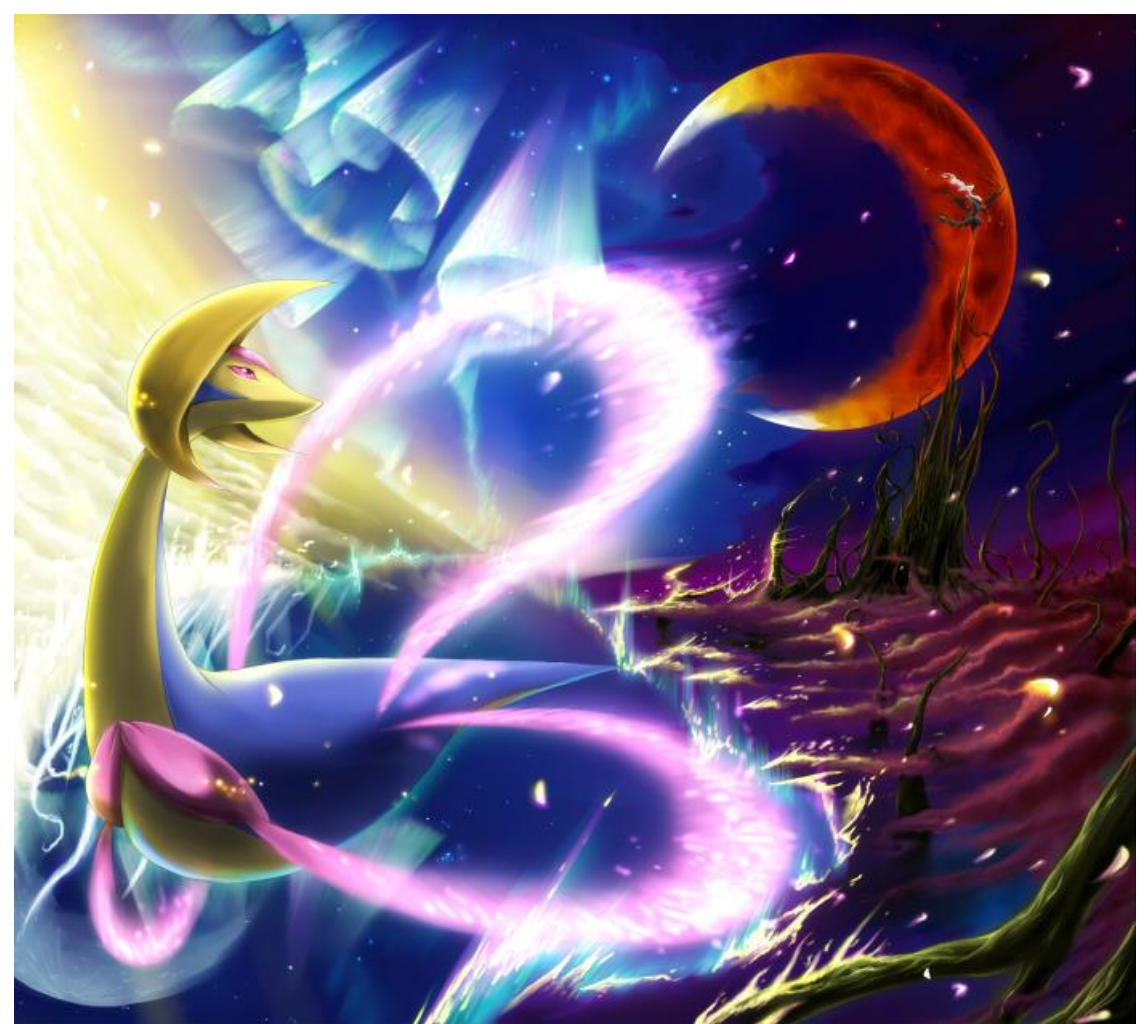
Cresselia / Darkrai Domains: Dreams, Fate, Heroism / Nightmare

Cresselia and Darkrai were created as two sides of a coin; where one is a bringer of new hopes, the other is a harbinger of nightmares. Together they create a balance, and for ages have been beacons for farseers and clairsentients to seek out or pray to. The Dream World is said to be composed of the thoughts of all living beings given form, and from it many visions of past, present and future can take place. Where one may see this as simply that these two embody extremes of this manifestation, it could also mean they were meant to be sought out by these gifted individuals to try to unveil events transpired or those yet to come. Likewise, these two may seek out individuals and grant them dreams to convey such scenes. Many a catastrophe has been avoided due to the warnings of Darkrai, and many a hero has risen due to the encouragement of Cresselia.