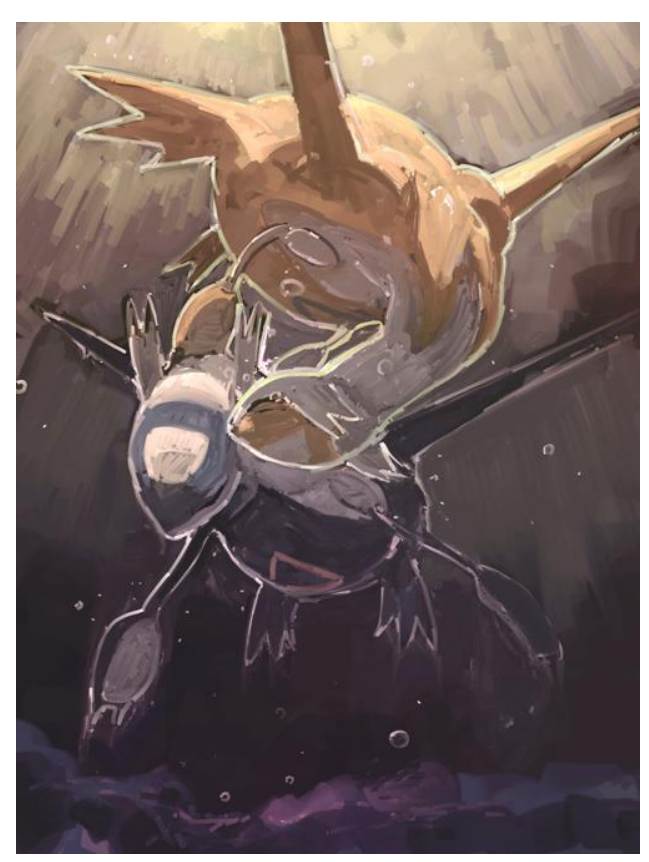
specifics of that are up to them.

"Ah, the lovers. Cute together ain't they? Most the facts bout them got clouded in myths long ago. Some think them cupids, seekin' out couples who never woulda met otherwise. Others think they seek out already established items to bless them. I wouldn't of minded either in my own life ya know?"